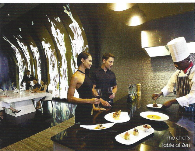
The chef's table at Zen