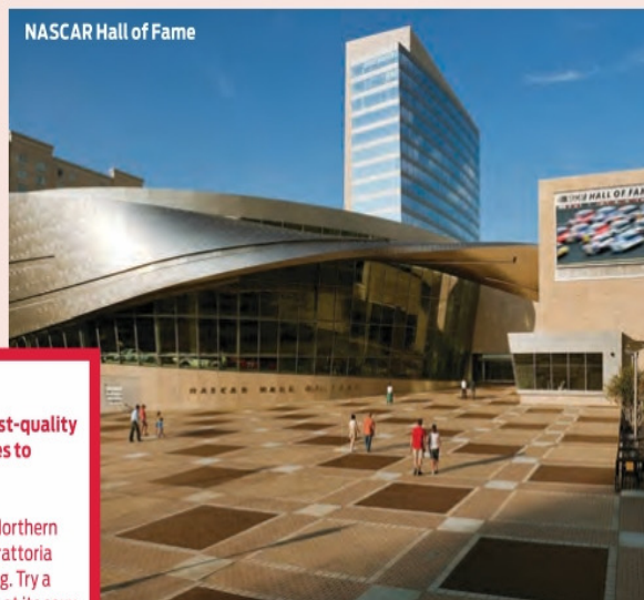
NASCAR Hall of Fame