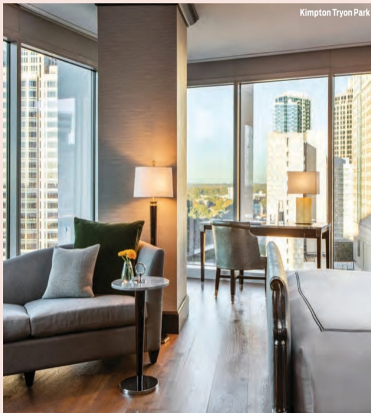
Kimpton Tryon Park