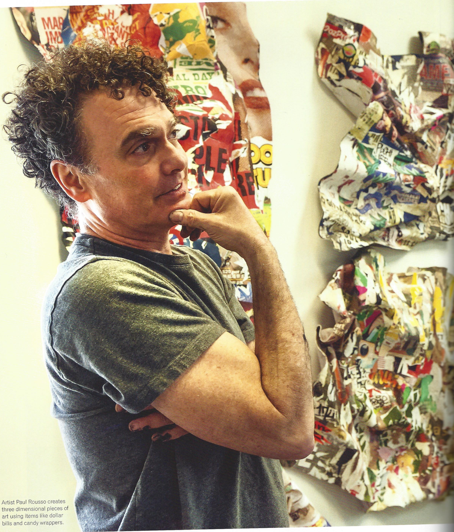
Artist Paul Rousso creates three dimensional pieces of art using items like dollar bills and candy wrappers.